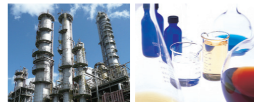
NS Styrene Monomer Co.,Ltd.