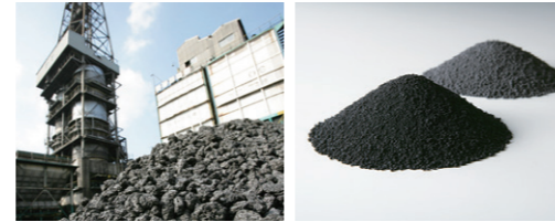
Nippon Techno-Carbon Co.,Ltd.