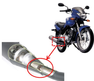
Example of mounted on Motorbicycle