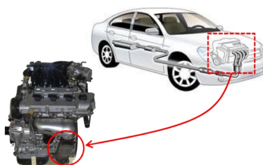
Example of mounted on Automobile