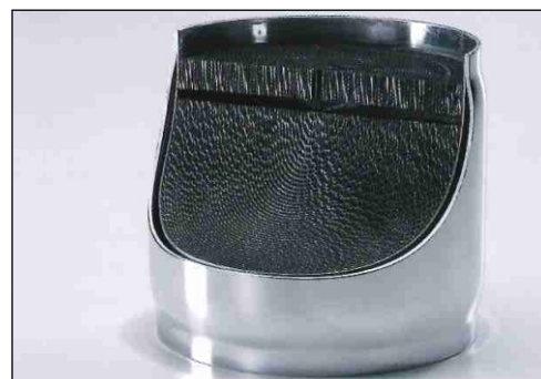
Dual Core Metal Substrate with Air Gap